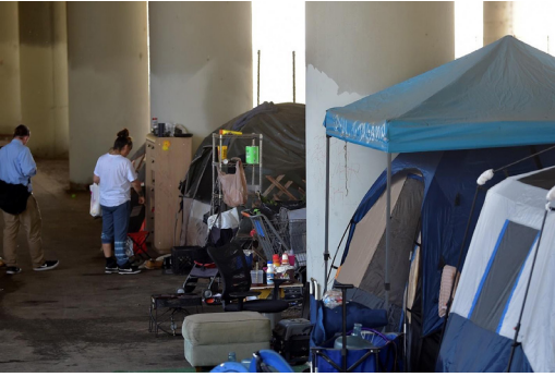
The homeless encampment at 2nd and Colorado in Arcadia.

Our City Council approved funds from the American Rescue Plan Act in the amount of $250,000 for the Prevention and Diversion of Homelessness Program. These funds will be allocated over the next four years. City Council also approved $100,000 for the hiring of 3 new full-time case managers to provide emergency services for the homeless.